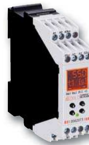
Multifunction timer MK 7830N